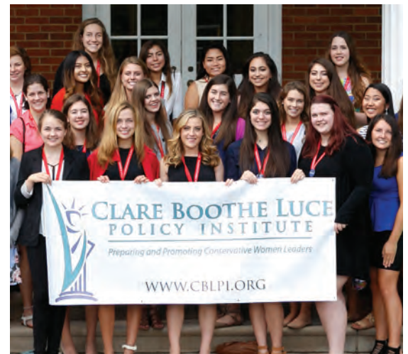
Students at our 2017 National High School Mentoring Luncheon

As we begin 2018 and celebrate the Institute's 25th year of preparing and promoting conservative women leaders, we look forward to building on our success and expanding our work. Later this year we'll open our Center for Conservative Women at our new expanded Headquarters which will allow us to reach and welcome in even more young women, and plans are underway for a new Regional Women's Summit this spring in Orlando. Thank you to our supporters who have been so critical to our success, our strong speakers who are such excellent role models, and most of all, our brave young women—the students who stand up to the Left on college campuses.