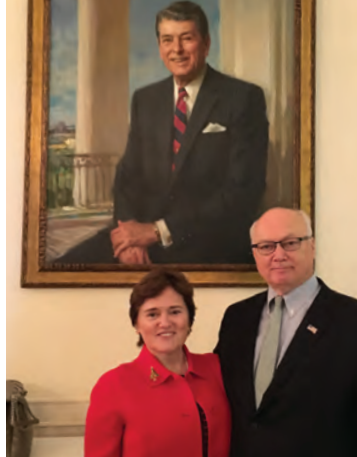
I was delighted to accept President Trump's invitation to attend his White House Christmas party. Here I'm with my husband of 43 years in front of our favorite White House painting.