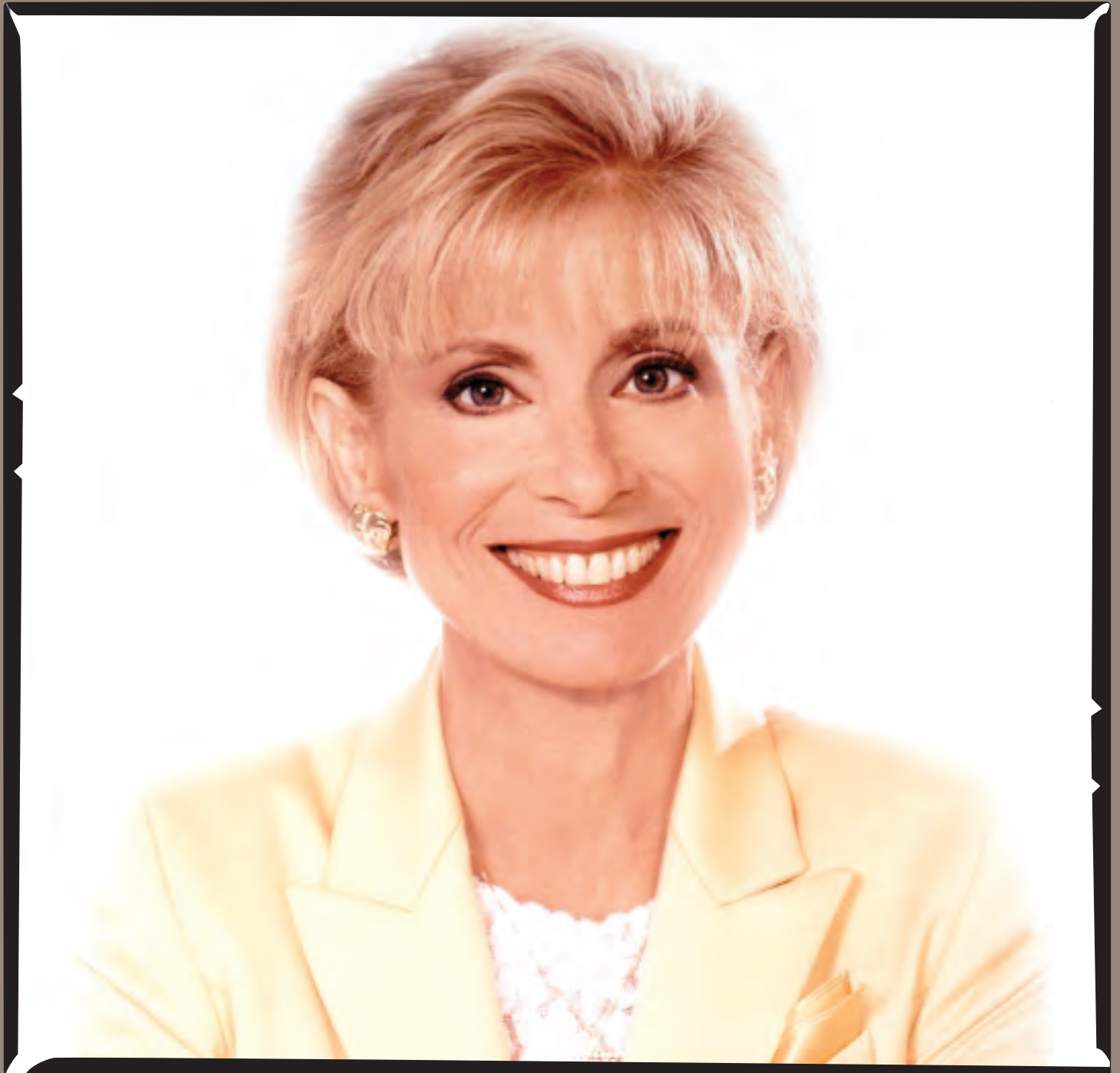
Dr. Laura Schlessinger