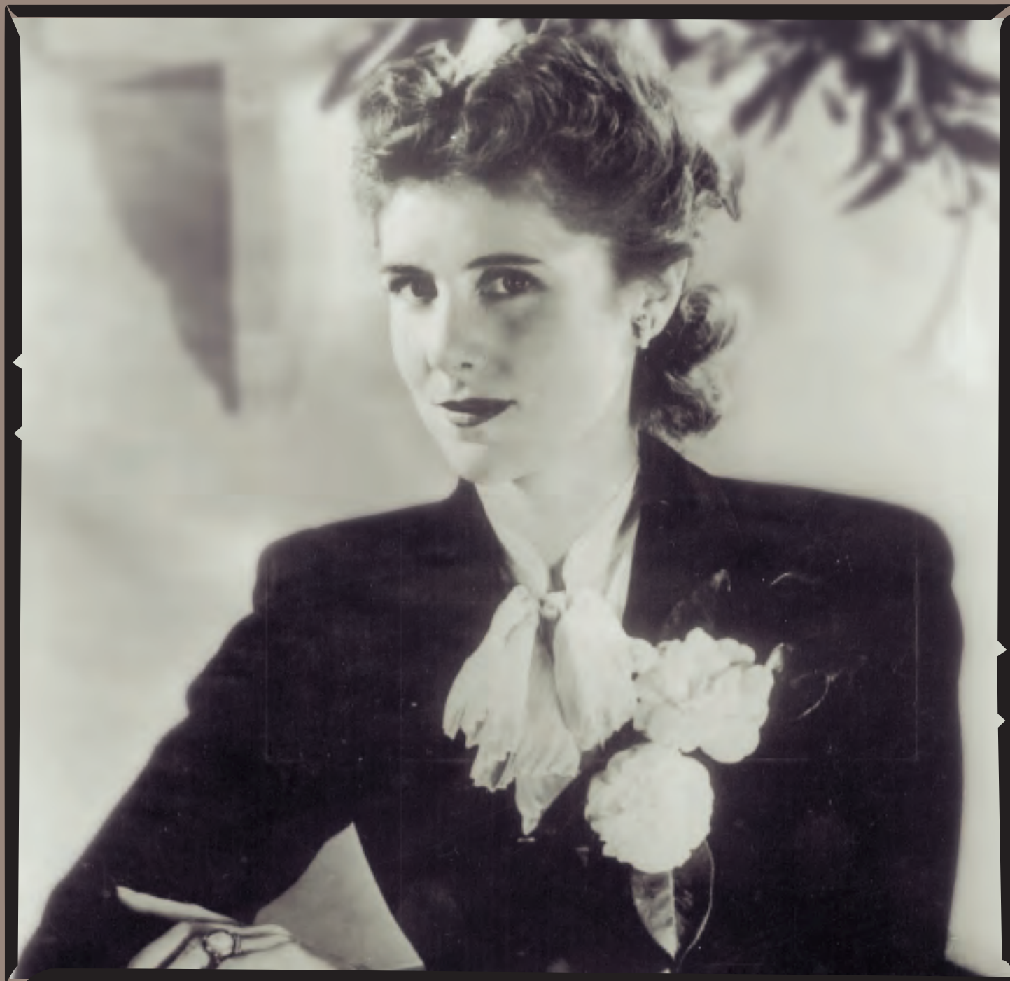
Clare Boothe Luce