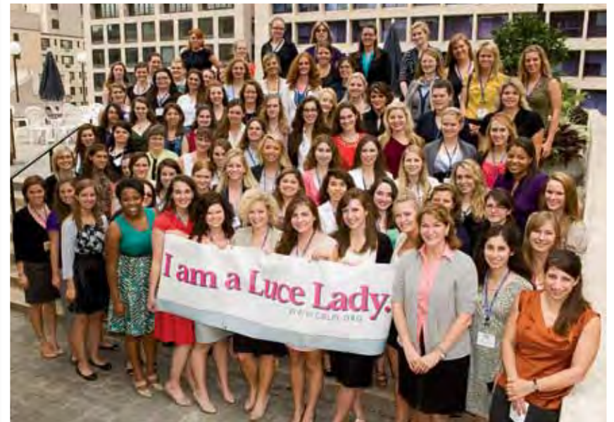
College students from across the country with speaker Bay Buchanan at a Luce mentoring luncheon.

We urge you to use this calendar daily to remind you of the beauty and greatness of America. And we hope the successful and influential women featured on its pages can galvanize you to take on a more active leadership role in advancing our conservative beliefs. All of the quotes used throughout the calendar are from Clare Boothe Luce, highlighting her extraordinary sense of humor, insight, and wisdom.